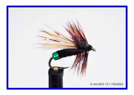
STALCUP BAETIS Size: 18 Family Matched: Mayflies Life Cycle: Nymph Fly Type: Generalists Pattern

The Stalcup Baetis is a bit of a bully when it comes to fly patterns. It's not content to be fished for just one hatch and always wants to be a part of the action when matching a number of mayfly and stonefly species across the continent. Don't let its thin physique fool you for a minute. This pattern is a scrapper, and has been known to give many a fish a sore lip!